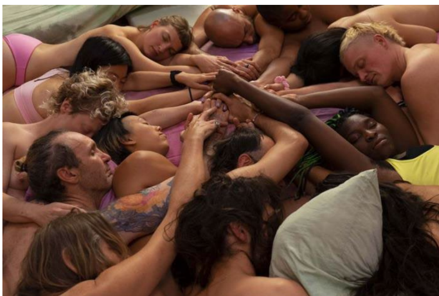
When the body says Yes , 2022, photo, ultra chrome, canson Lustre, museum glass, 63,8x111,8 cm, Courtesy the artist & AKINCI

What does it mean to summon a queer collective body to create a spell? How do we recognize the voice of our collective body and our voice inside of it? And to which collective future do our bodies say YES?